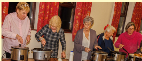
The slow-cooker brigade did a fantastic job!

There are two United Benefice services this month. On Thursday 9 May at 10am, there's an Ascension Day service at Ludgvan, followed by Brunch. And on 26 May in Perranuthnoe Church at 6pm there'll be a Choral Evensong . All are very welcome.